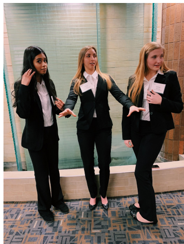
Favorite HOSA Picture