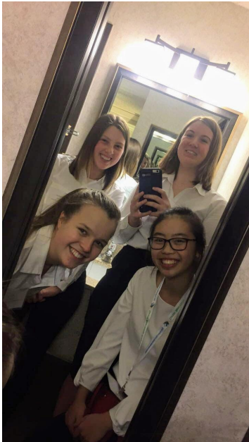
Favorite HOSA Picture