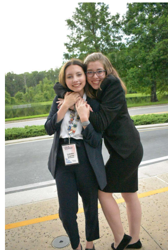
Favorite HOSA Picture

Picture Caption- These suits clash, but I love her anyway;)