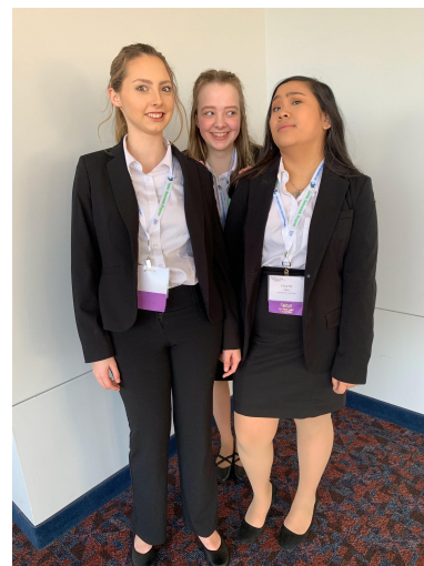
Favorite HOSA Picture

Picture Caption- When people try to sell a china pin for 80$.